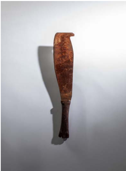
Object from the Smithsonian's National Museum of African American History and Culture. Sugar cane cutter, metal and wood, 19th century.

Before cotton dominated American agriculture, sugar drove the slave trade throughout the Caribbean and Spanish Americas. Sugar cane was a brutal crop that required constant work six days a week, and it maimed, burned and killed those involved in its cultivation. The life span of an enslaved person on a sugar plantation could be as little as seven years. Unfazed, plantation owners worked their enslaved laborers to death and prepared for this high "turnover" by ensuring that new enslaved people arrived on a regular basis to replace the dying. The British poet William Cowper captured this ethos when he wrote, "I pity them