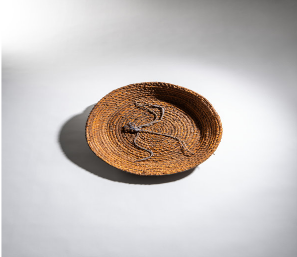
Object from the Smithsonian's National Museum of African American History and Culture.

Enslaved black people came from regions and ethnic groups throughout Africa. Though they came empty-handed, they carried with them memories of loved ones and communities, moral values, intellectual insight, artistic talents and cultural practices, religious beliefs and skills. In their new environment, they relied on these memories to create new practices infused with old ones. In the Low Country region of the Carolinas and Georgia, planters specifically requested skilled enslaved people from a region stretching from Senegal to Liberia, who were familiar with the conditions ideal for growing rice. Charleston quickly became the busiest port for people shipped from West Africa. The coiled or woven baskets used to separate rice grains from husks during harvest were a form of artistry and technology brought from Africa to the colonies. Although the baskets were utilitarian, they also served as a source of artistic pride and a way to stay connected to the culture and memory of the homeland.