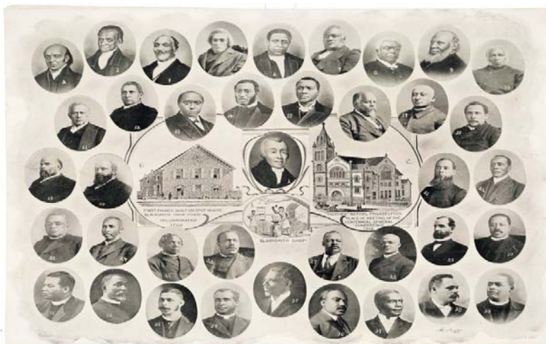
1916 poster for the Mother Bethel A.M.E. Church in Philadelphia, with its founder, Richard Allen, at center.

Black people , both free and enslaved, relied on their faith to hold onto their humanity under the most inhumane circumstances. In 1787, the Rev. Richard Allen and other black congregants walked out of services at St. George’s Methodist Episcopal Church in