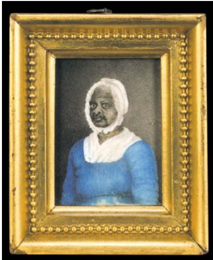
Elizabeth Freeman, Mum Bett From the Smithsonian's Museum of African American History and Culture

The new Massachusetts Constitution of 1780 stated that “All men are born free and equal, and have certain natural, essential and unalienable rights; among which may be reckoned the right of enjoying and defending their lives and liberties.” Arguing that slavery violated this sentiment, Bett sued for her freedom and won. After the ruling, Bett changed her name to Elizabeth Freeman to signify her new status. Her precedent-setting case helped to effectively bring an end to slavery in Massachusetts.