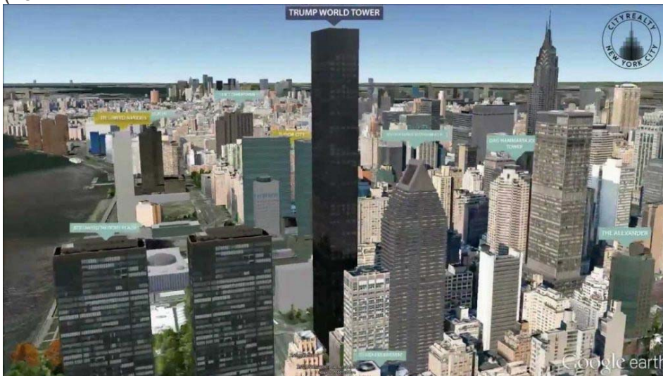
Trump World Tower Manhattan

The distance between Seoul and Pyongyang is about 121 miles, less than the distance between the Trump Tower in Manhattan and The Trump Taj Mahal Casino in Atlantic City (131 miles)